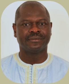
HON. SEEDY KM KEITA Minister of Finance and Economic Affairs