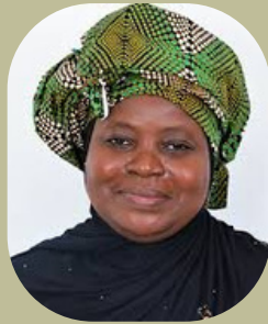
HON. ROHEY JOHN MANJANG Minister of Environment, Climate Change and Natural Resources