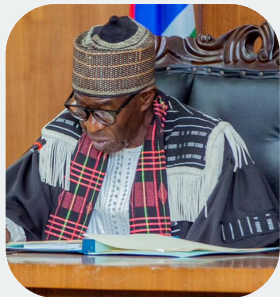
Hon. Fabakery Tombong Jatta Speaker