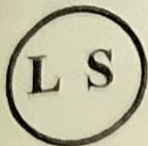
YAHYA A. J. J. JAMMEH President

An Act to amend the Local Government Act, 2002 and for connected matters.